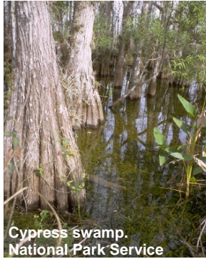
Cypress swamp. National Park Service

May is American Wetlands Month! The month was designated in 1991 by the U.S. Environmental Protection Agency and its partners to celebrate the important benefits of wetlands. Here, learn about the many plants found in wetlands some of the interesting adaptations they have developed.