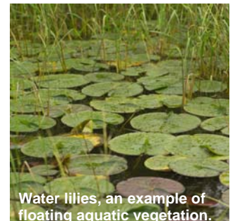
Water lilies, an example of floating aquatic vegetation.

Riparian – found along the edges of wetlands or other water bodies.